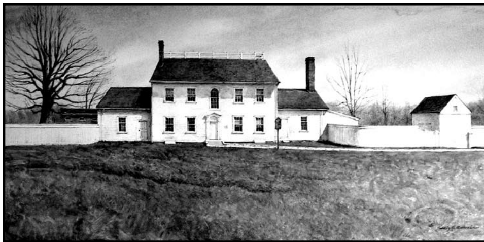
“Joseph Priestley House”